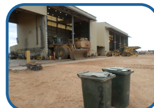
Workshop & Stock Audit