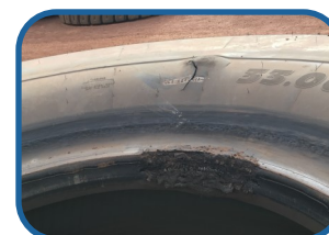
Early Life Tyre Failure