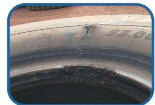
Early Life Tyre Failure