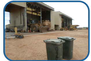
Workshop & Stock Audits