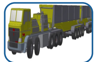
400T+ Electric Drive Road Train